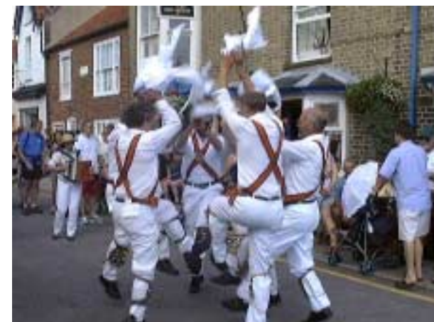
"Good company, good exercise, no charge"

This year, the charity we are planning to support is Emmaus UK , an organisation dedicated to the principle of 'Helping Homeless People Help Themselves'. We hope you will assist us with your contributions.