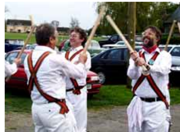
"Good company, good exercise, no charge"

On the morning of the early May Bank Holiday, the Devil's Dyke Morris Men will dance the length of the Devil's Dyke, the earthwork from which the side takes its name. We will be seeking sponsorship for this event, the proceeds from which will be given to the Guide Dogs for the Blind Association and the Wildlife Trust . See the web site or one of the Men for more details.