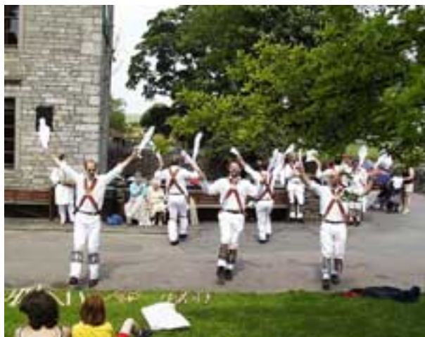
"Good company, good exercise, no charge"